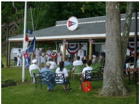
Flag Raising 2010!!!!