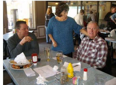
Here I am!!!!.....What?????