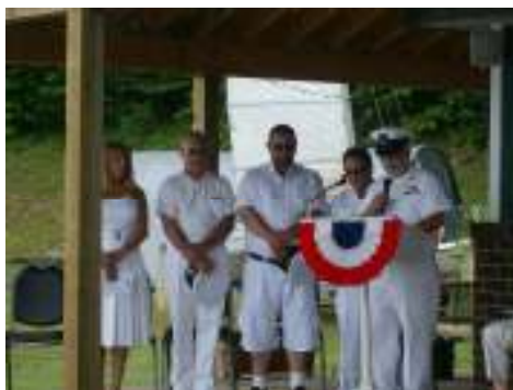
Flag Raising 2009